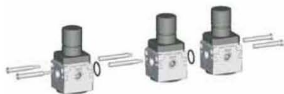
Assembly without end plates