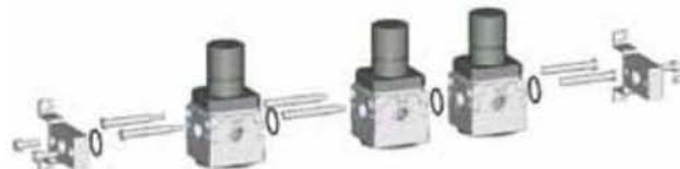
Assembly with end plates