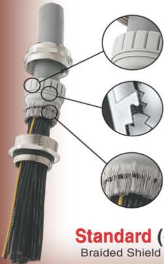
Standard (-BE) Braided Shield Only

Overlapping clamping splines apply a concentric force, thereby preventing the form seal from being pulled out of the fitting. This ensures pull-out protection without damage to the cable.