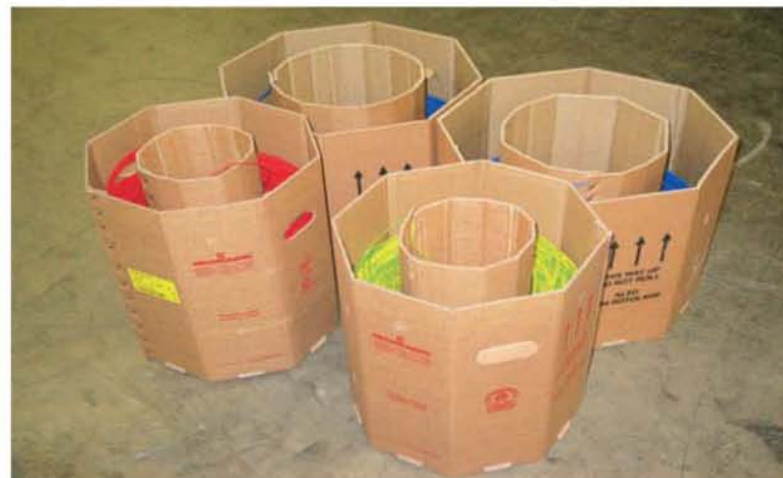
Delivery for one-way barrel